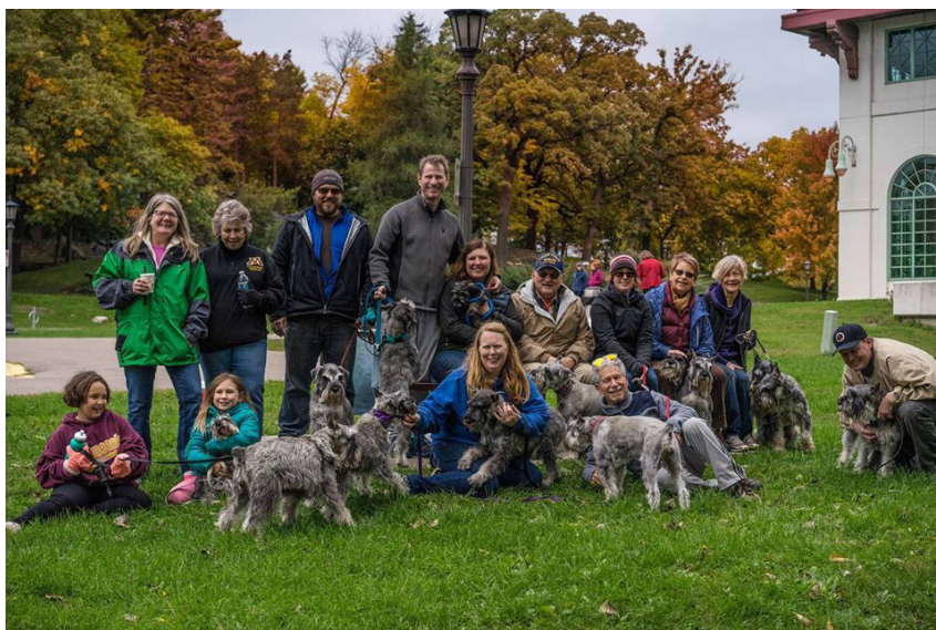
Members who attended the group walk event in October 2018.