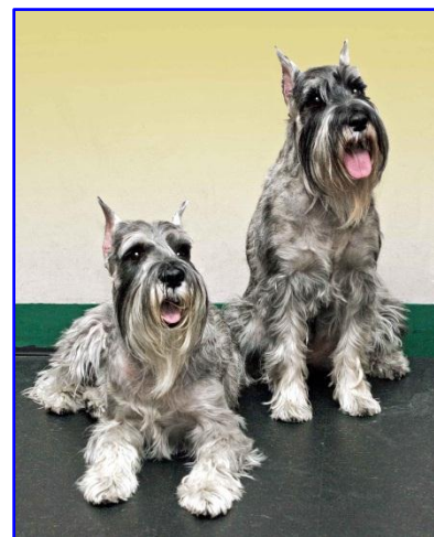
Baylee (l) shown here with Harper

Glad that one of your presents will be having fun running agility this weekend!! Love ya Miss Baylee!!"