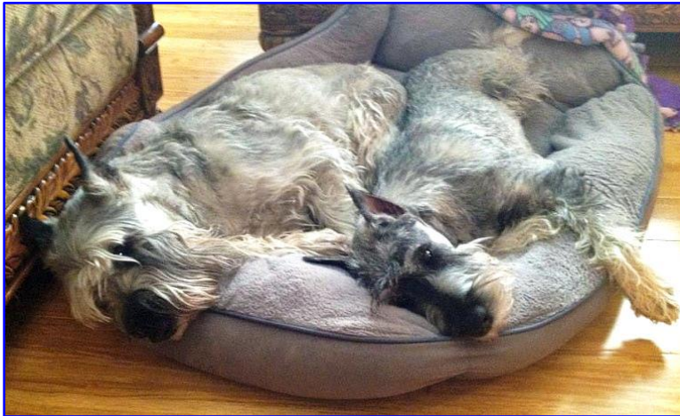
Here's Maddie & Bria getting in some snuggle time together. "Boy, it really is a dogs' life, isn't it?"

Then Willow comes along and sez "Scoot over gals. This is a 3 butt bed!"