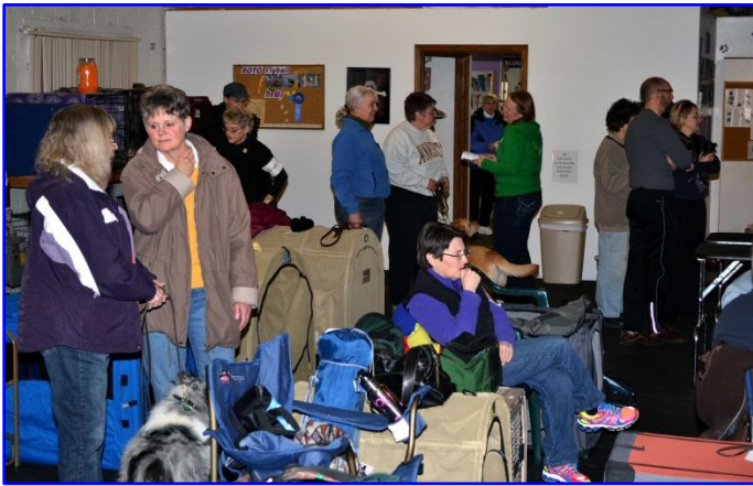
We had a nice turnout for the match that featured novice, open and utility.