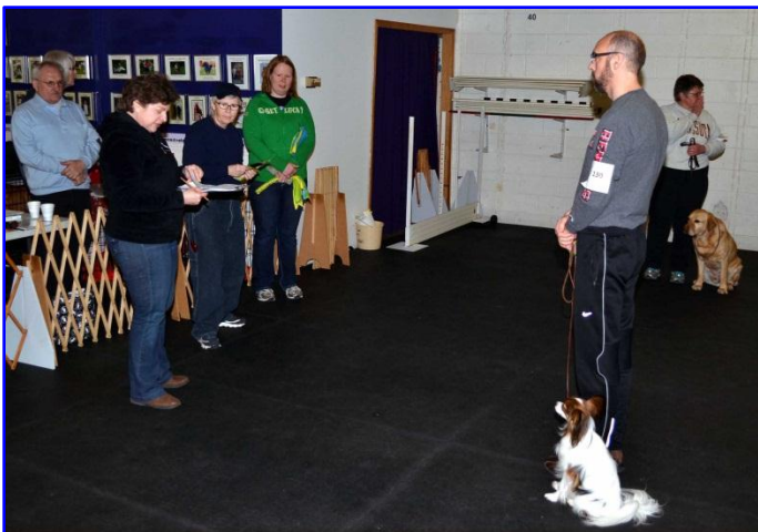
Bringing out the novice placement winners.