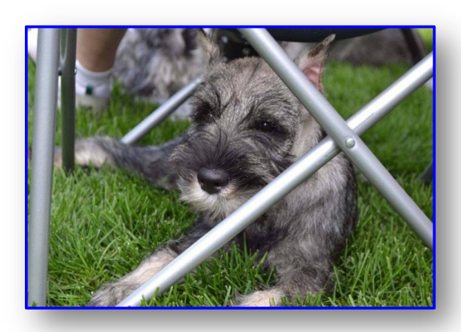
JJ sez, "Lots of things I never done. I ain't never had too much fun!"