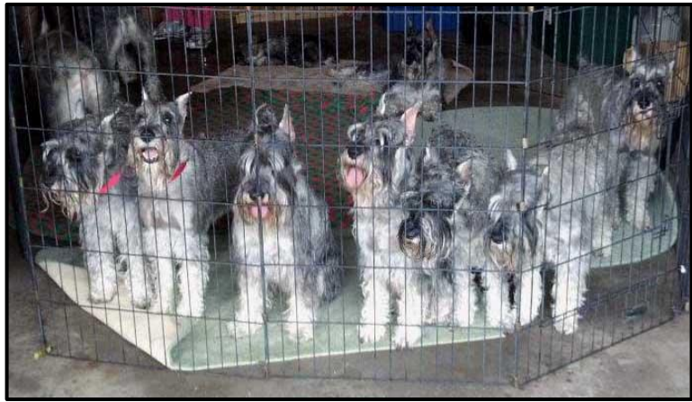
Behind bars was the only way to get a 'group shot'.