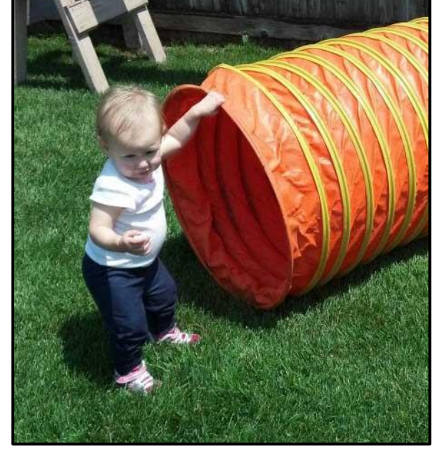
"Where did the puppy go, Mom?"