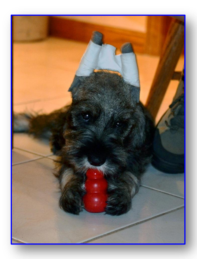
"My Kong, 'dads' reassuring foot & I'm fine!"