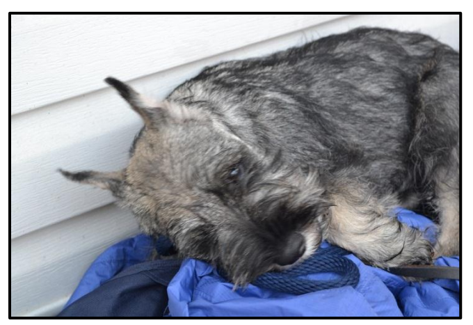
JJ is pooped out & naps on 'mom's' jacket.