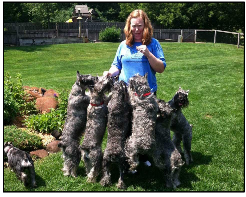
"Hey, these fingers taste just like tuna fudge!"