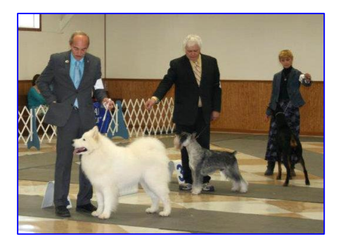
And on Sunday April 1, Bronze Grand CH Himmlisch Furst Magic Moment "Magic" got Breed and a Group 3.

Saturday in Dewitt, CH Cedar Hills Enchanted Yellow Yellow Rose "Ellie" got Breed and went on to a Group 2.