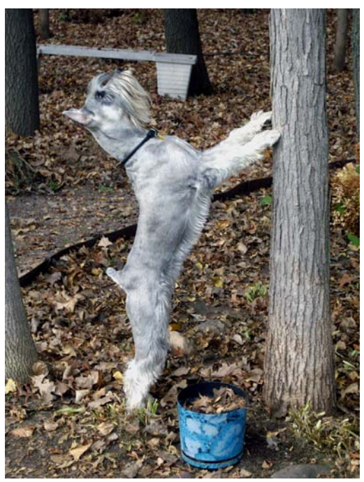
BAXTER! Uncle Joe said to not chase squirrels higher than 10 ft. Better git back down here cousin!

Tails Up Dog Training offers both confirmation classes as well as several levels of obedience training classes are available in Burnsville. Visit <a href="https://www.tailsupdogtraining.com">www.tailsupdogtraining.com</a> for the scoop on what's happening.